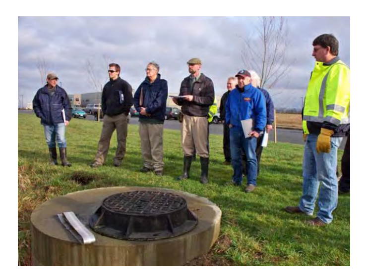
Figure 6: Private Stormwater Facility Workshop

Skagit County adopted a permanent ordinance (#O20100002) on May 18, 2010 amending the drainage ordinance to be compliant with our NPDES Phase II Permit requirements and taking the place of a previous interim ordinance (Ordinance #O20090008).