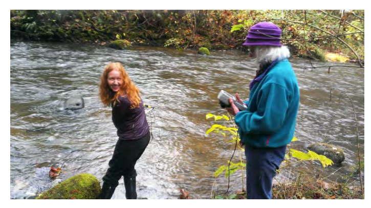
Figure 2: Stream team volunteers taking water quality samples.